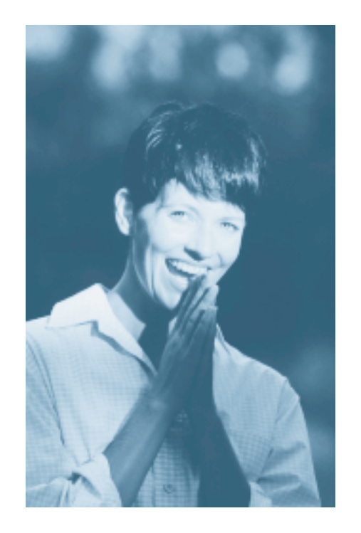
How COX-2 Relates to Minor Pain Exertion from everyday activities can send messages to your cells to produce

more COX-2 and to have some of the phospholipids in your cell membranes assemble and release the fatty acid arachidonic acid. COX-2 then catalyzes the conversion of arachidonic acid into prostaglandins, particularly Prostaglandin E-2 (PGE-2). Prostaglandins are hormone-like compounds that help regulate many body systems and PGE-2 is specifically responsible for inflammation. The result: minor pain and inflammation.